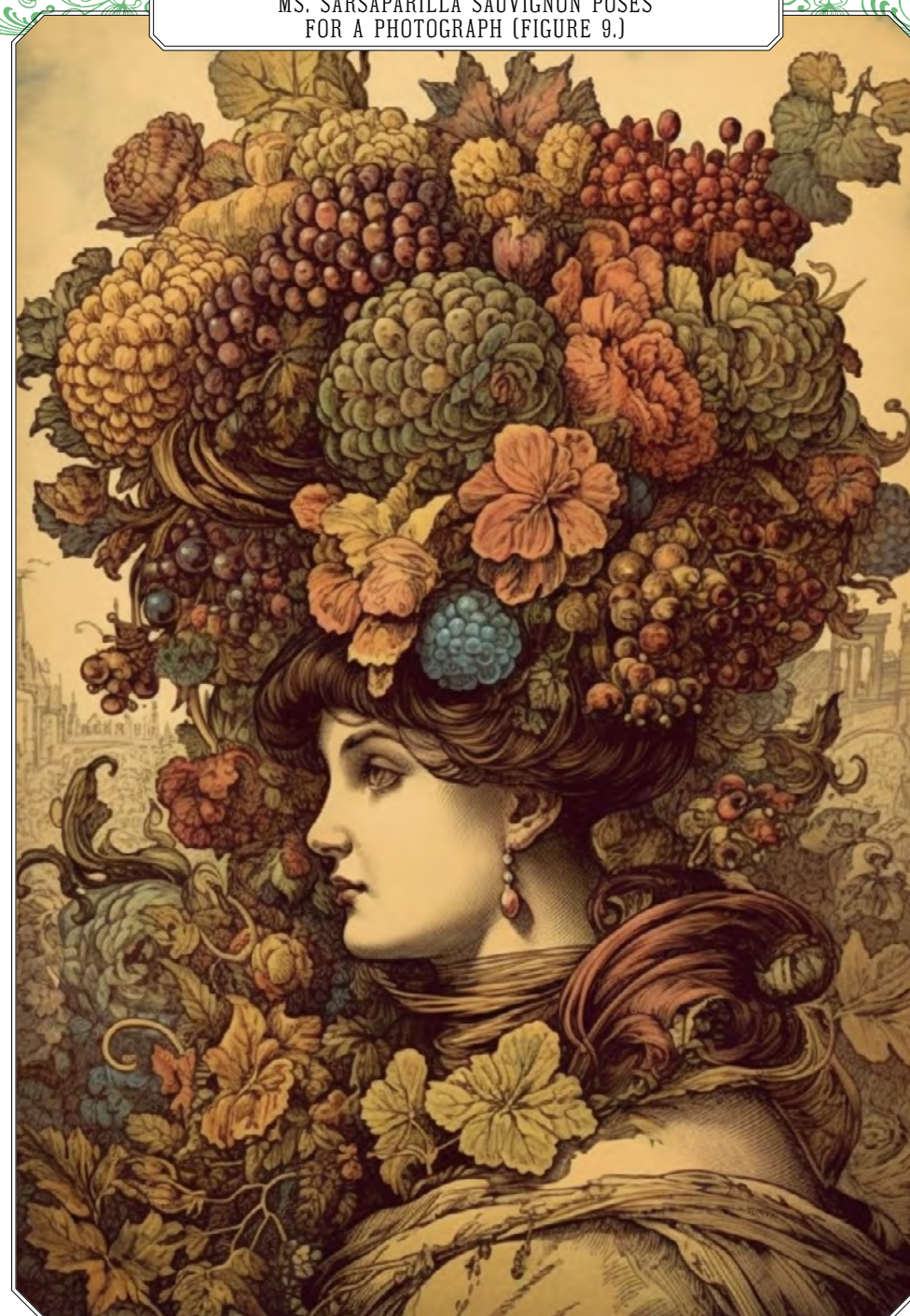
MS. SARSAPARILLA SAUVIGNON POSES FOR A PHOTOGRAPH (FIGURE 9.)