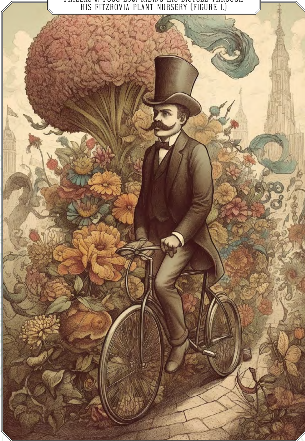
PHILEAS J. FOGG ESQ. RIDING HIS BICYCLE THROUGH HIS FITZROVIA PLANT NURSERY (FIGURE 1.)