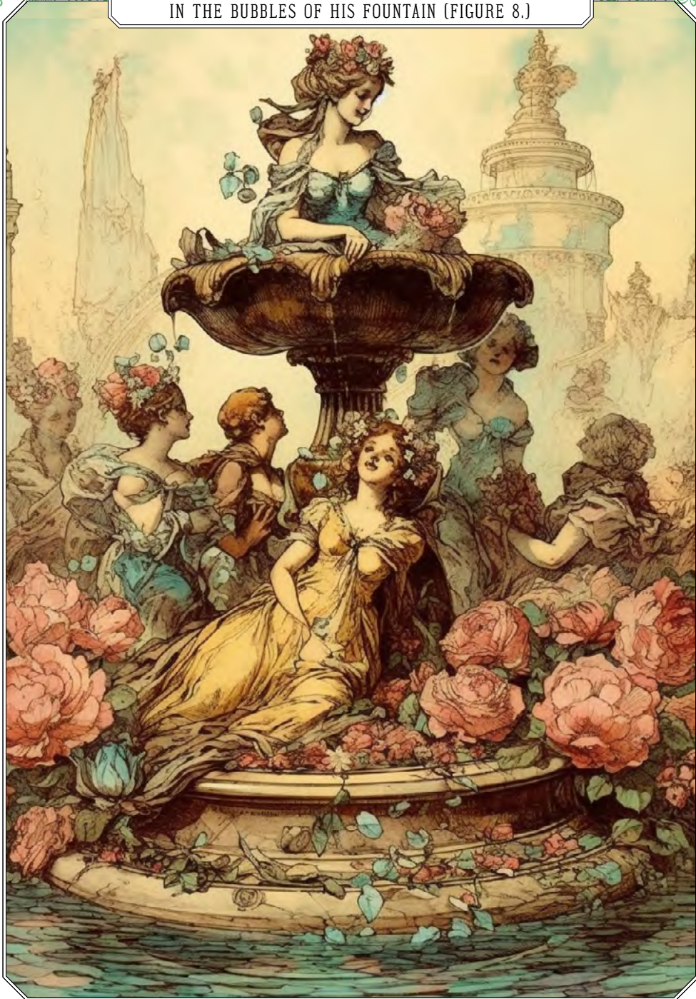
PHILEAS J. FOGG'S ESQ.'S LADY FRIENDS BATHE IN THE BUBBLES OF HIS FOUNTAIN (FIGURE 8.)