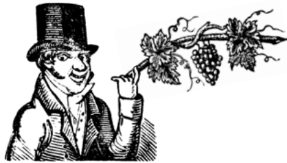
MS. SARSAPARILLA SAUVIGNON POSES FOR A PHOTOGRAPH (FIGURE 9.)

Wine The great and divine natural remedy!