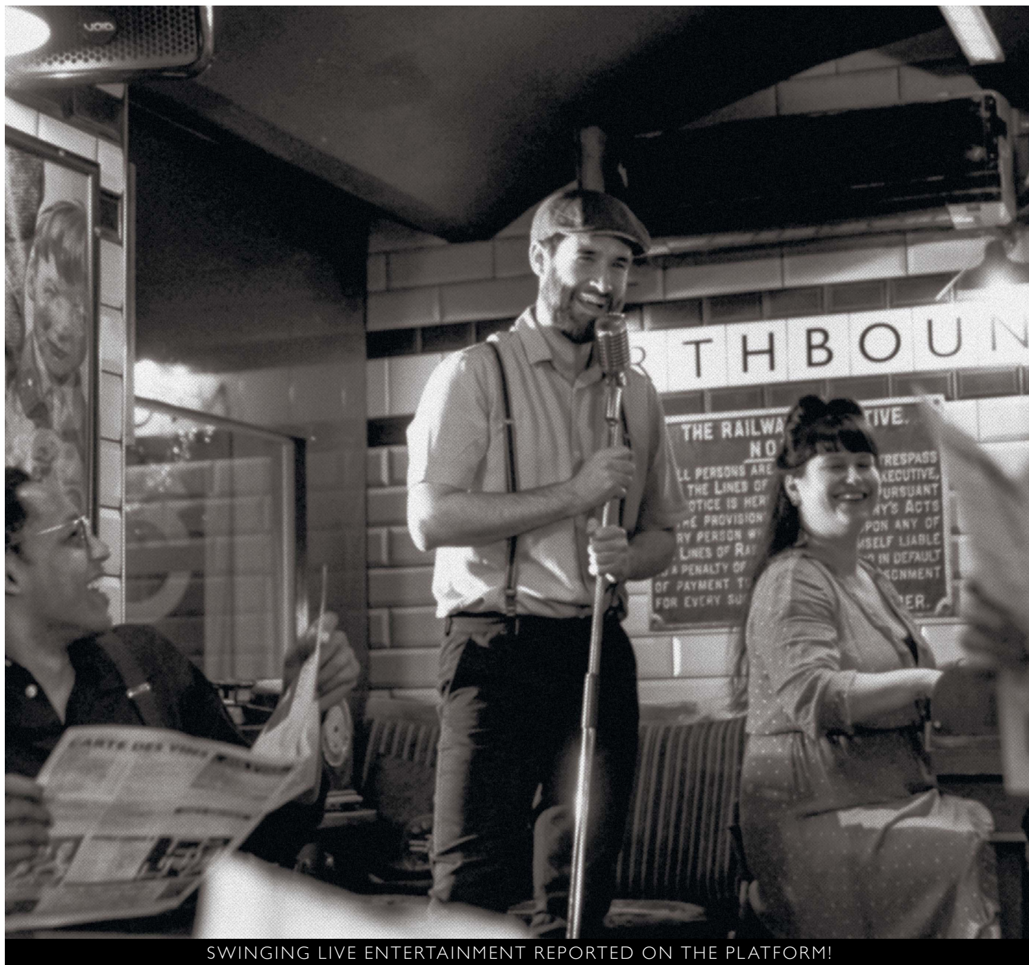
SWINGING LIVE ENTERTAINMENT REPORTED ON THE PLATFORM!