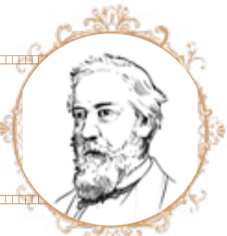
JAMES GILLESPIE BLAINE

THE APACHE RENEGADE £16 FRESH / LIGHT / DELICATE Patrón Silver tequila, Laphroaig 10yr Scotch whisky, prune eau de vie, verjus and epazote-infused agave syrup