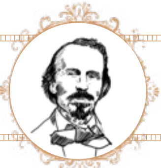
CARLOS MANUEL de CÉSPEDES del CASTILLO

SAGRADA UNFAMILIAR £15 CREAMY / SWEET / TROPICAL Santa Teresa 1796 rum, Figaro fig liqueur, zabaione, blended banana & coffee almond milk and salted cinnamon syrup