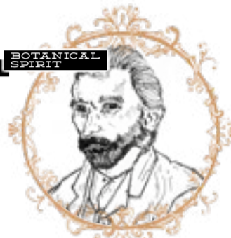
VINCENT WILLEM van GOGH

CRAZY IN LOVE £15 SWEET / FRUITY / TROPICAL Ketel One Botanical Grapefruit & Rose spirit, Muyu Jasmine Verte liqueur, passion fruit juice, yoghurt powder and Moët & Chandon Impérial Blanc N.V. Champagne cordial