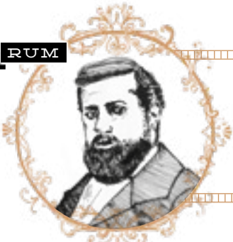
ANTONI GAUDÍ i CORNET

SAGRADA UNFAMILIAR £15 CREAMY / SWEET / TROPICAL Santa Teresa 1796 rum, Figaro fig liqueur, zabaione, blended banana & coffee almond milk and salted cinnamon syrup