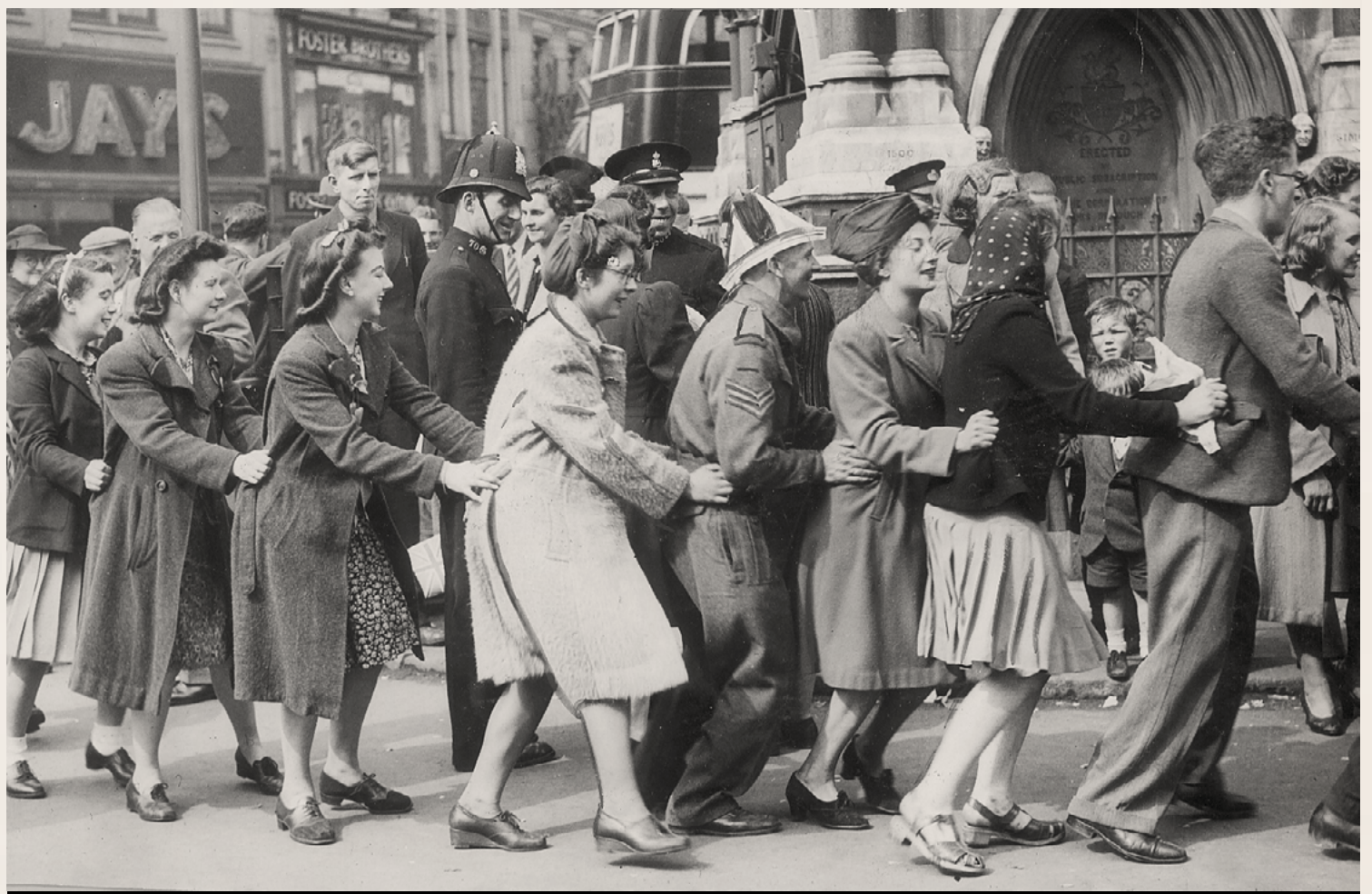
DOWN THE APPLES & PEARS! ITS TIME FOR A KNEES-UP!