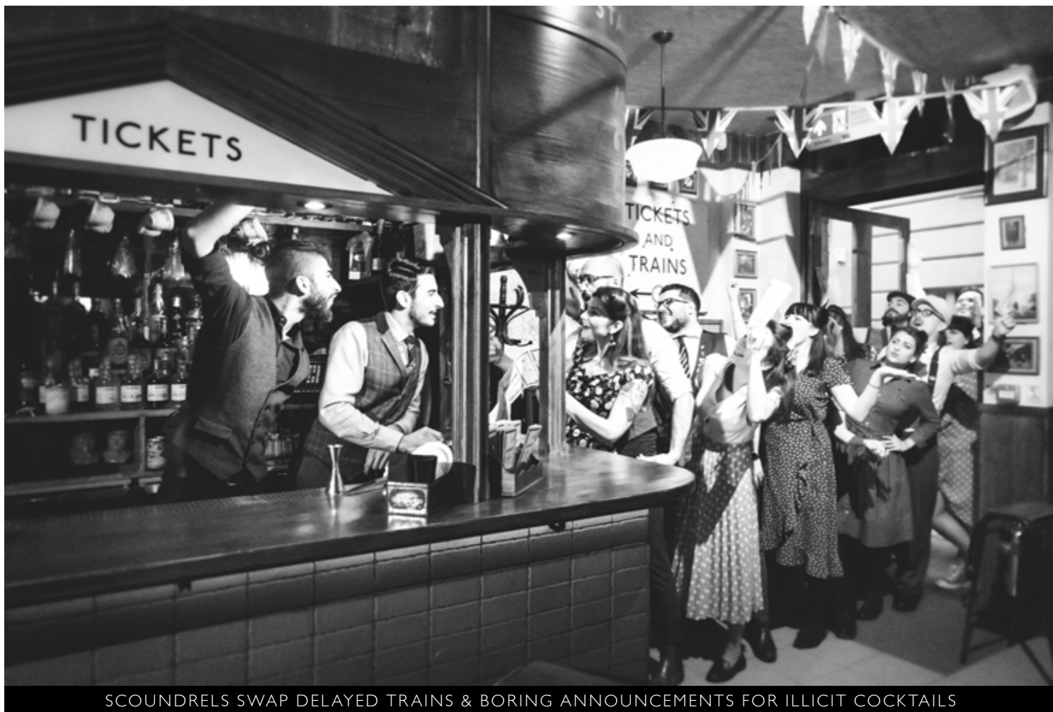
SCOUNDRELS SWAP DELAYED TRAINS & BORING ANNOUNCEMENTS FOR ILLICIT COCKTAILS